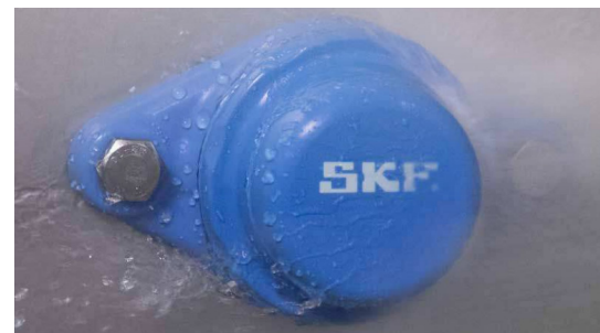
SKF Food Line ball bearing units