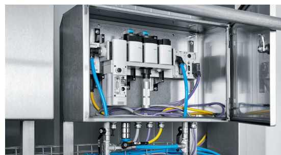
Festo's MSE6-E2M energy module